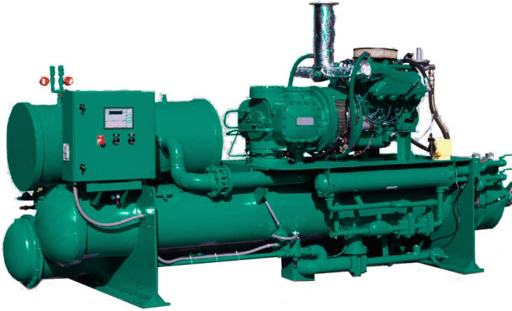
STx Series 150 & 200 Tons